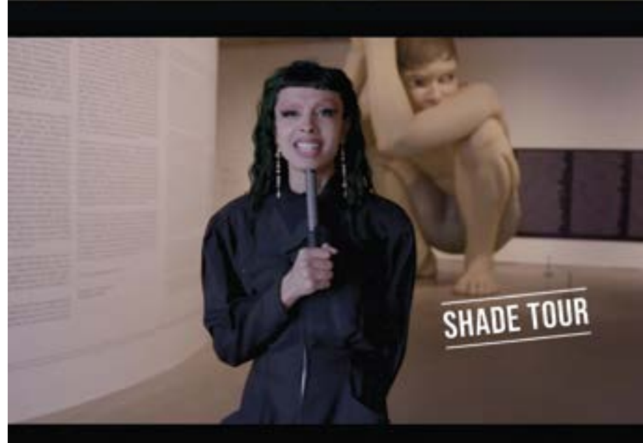
Feminist Collective with No Name, 'FCNN News', 2018-2019, videos, episode 1-3, 14 min. Stills from episode 2.